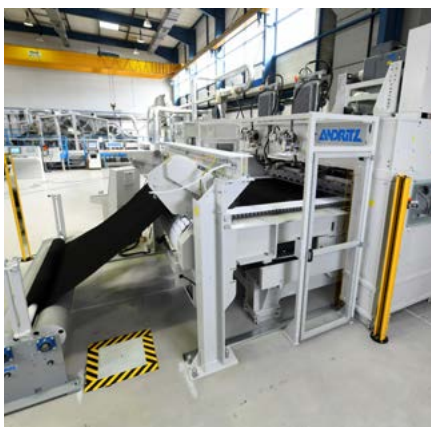
ANDRITZ SDV velour needleloom