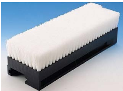
Original ANDRITZ design of the brush