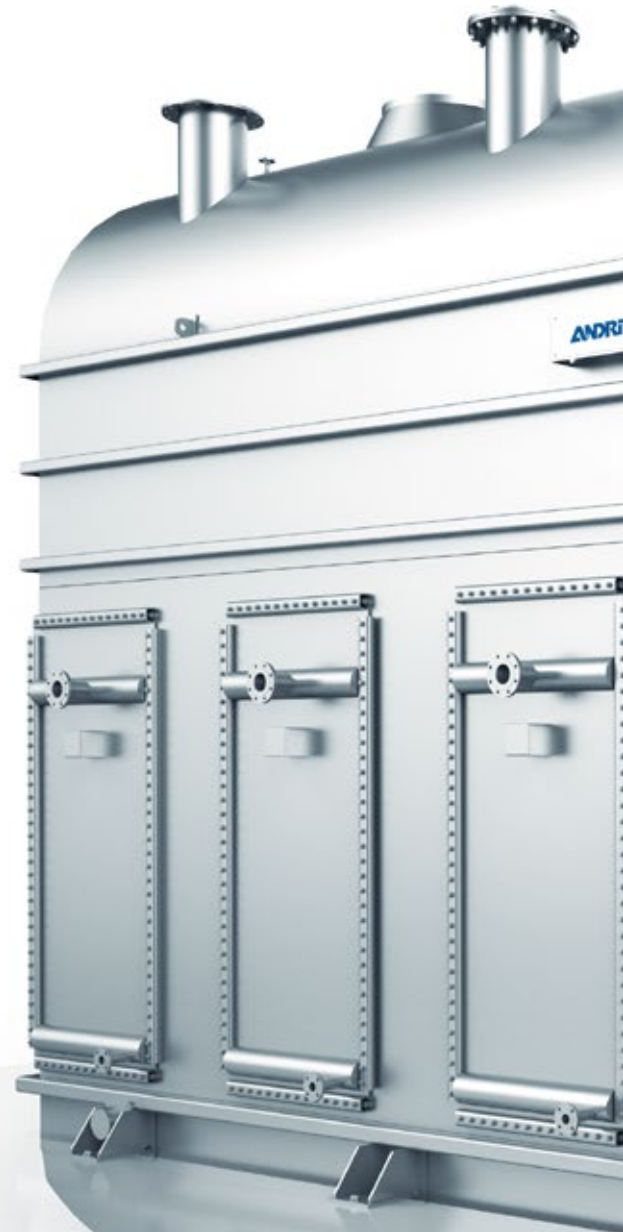
Fluidized bed unit for polymers